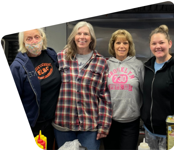
Upper Lake kitchen thoroughly cleaned and ready for the season