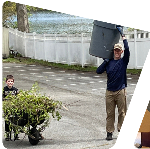
Starting 'em young!